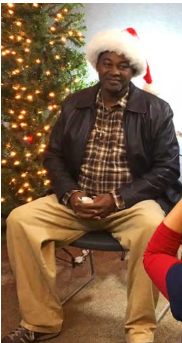
A neighbor sits for a photo at our Christmas Party

We hope this expression of gratitude will excite and encourage you as we continue CES' mission together.