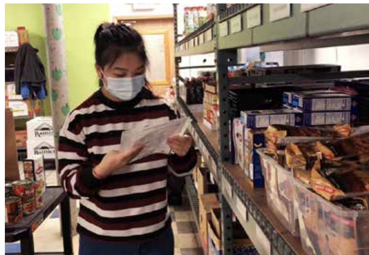
A Home Delivery volunteer shops requested items for a client