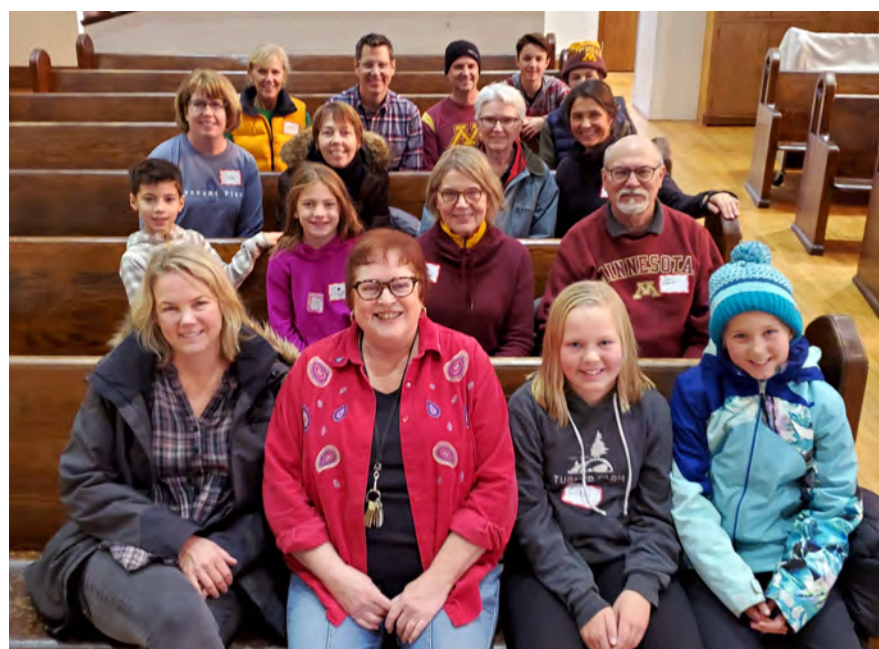
A team of Bethlehem Lutheran All-Stars: In 2 hours, they removed food from the shelves, washed and put it all back, cleaned 3 large coolers, cleaned general places in the Food Shelf, made double bags for clients, packed 30 5-pound cat food bags, mopped the inside of the cooler and washed MOW bags!