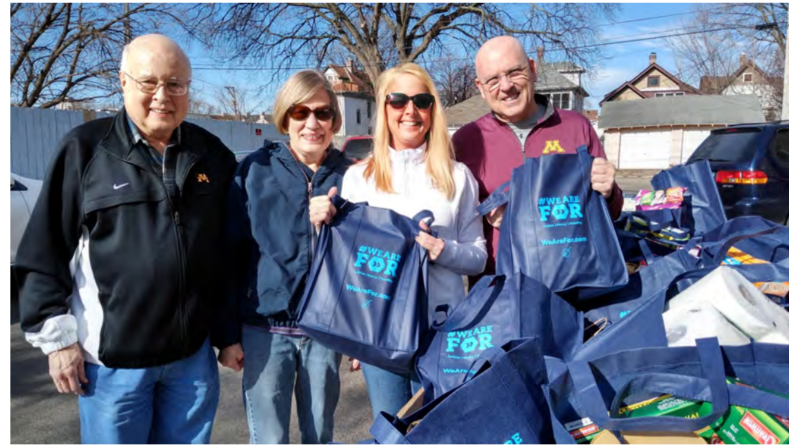
Wooddale Church members are big supporters of CES during MN FoodShare