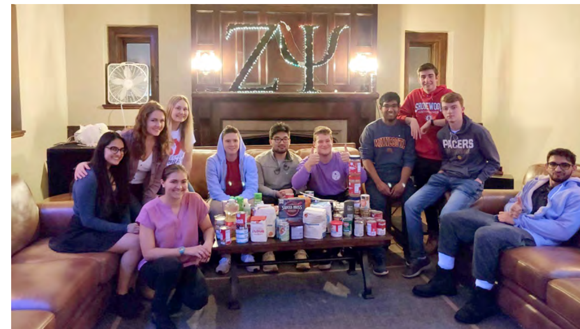
Members of Zeta Psi and Alpha Sigma Kappa groups ran a food drive for last year's MN FoodShare