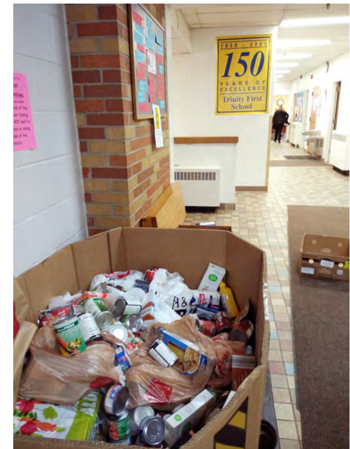
MNFS donations given by Trinity First students