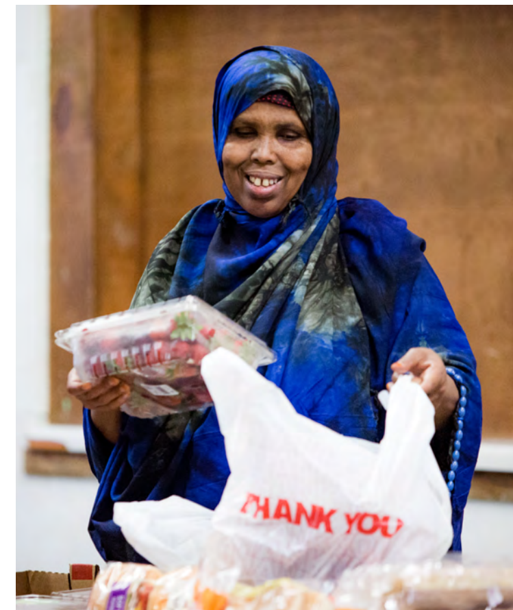
A neighbor selects some produce in our Food Shelf

As we enter March Food-Share Campaign month, please remember those in need in our ethnically diverse neighborhood.