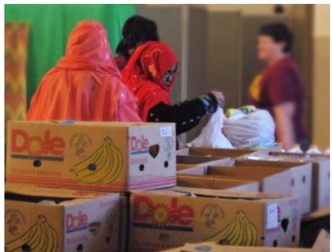
Shopping at the East African Distribution

CES is "A place where people come hungry and leave hopeful."