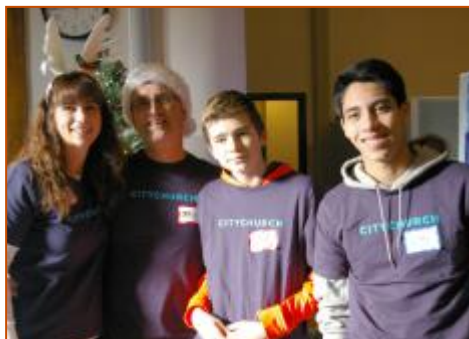
Getting in the spirit of Christmas, a family from City Church volunteered at the 2015 distribution

Distribution Saturday, 10 am-noon, December 17