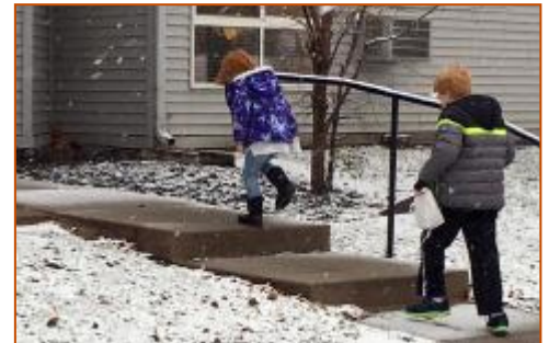
Kids from one family had fun delivering Meals on Wheels meals in the snow last year!

Be done in time for your Holiday Celebration