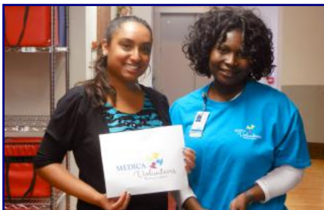
It takes many drivers to take meals each day to over 300 recipients. Join the CES team of drivers like this team from Medica.