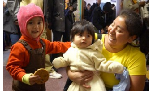
A family enjoyed a snack as they arrived