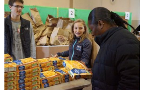
Pies were given before a gift card was presented to buy the meat of their choice

Each year volunteers come to distribute food baskets and each year grateful neighbors received them.