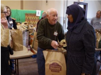
Willing volunteers handed out food as they spread the joy of giving