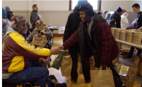
Neighbors warmly greeted each other