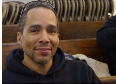
Our guests enjoyed live piano music while they waited